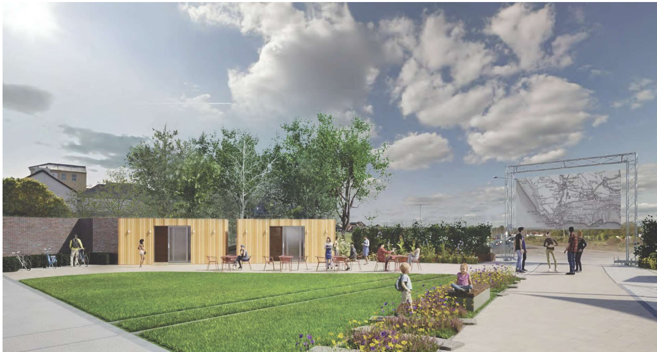
View looking across the lawn towards new container units