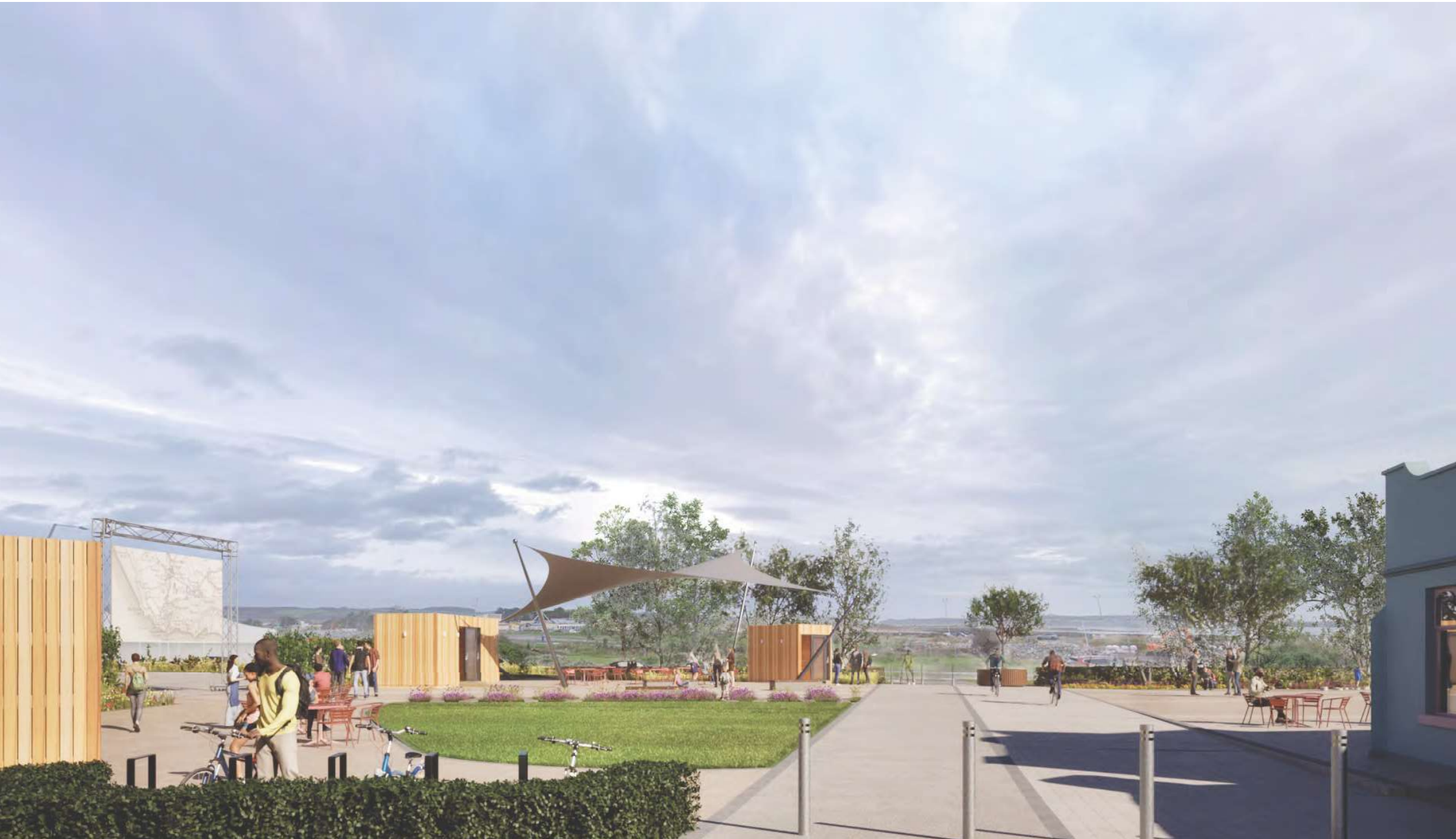
View looking south from Active Travel route