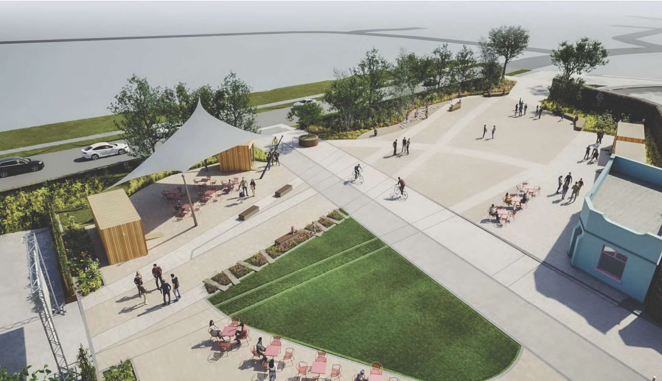
View looking south from North West corner of Hillsboro Square