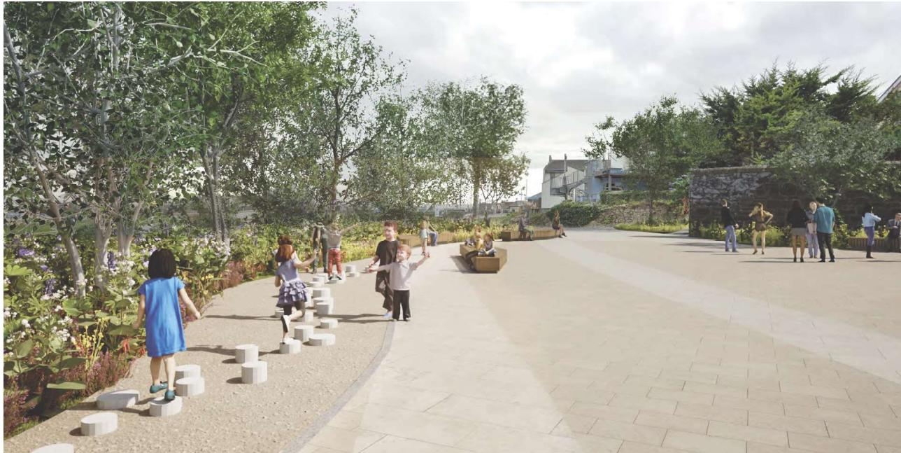
View looking north along Eastern planting and integrated play area